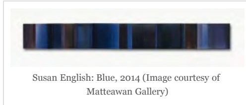
Susan English: Blue, 2014